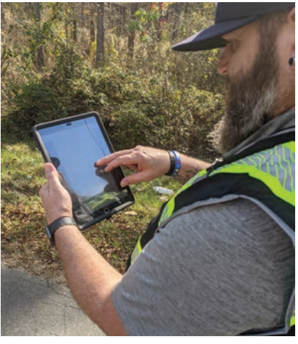
The American countryside is filled with scenes of communications infrastructure under construction. NRTC is helping members design projects, attain financing, build networks and help with day-to-day planning.