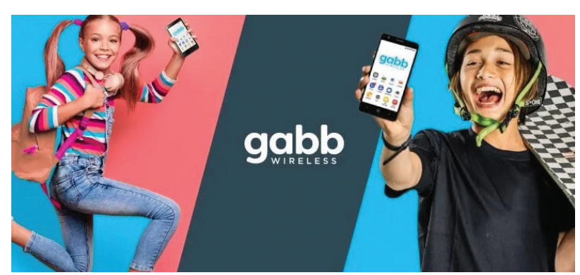
NRTC is happy to work with innovators, such as Gabb Wireless, which used the unique characteristics of NRTC Mobile Solutions to perfect kid-safe mobile phones.

In 2021, Mobile Solutions combined those capabilities to help Gabb Wireless develop specialty phones and smart watches for kids. The goal was to produce phones that operated in a closed system and provided a safe online environment for users aged 8 to 18. Parents can block unsafe social media and other content, take steps to prevent cyberbullying and control kids' total daily screen time.