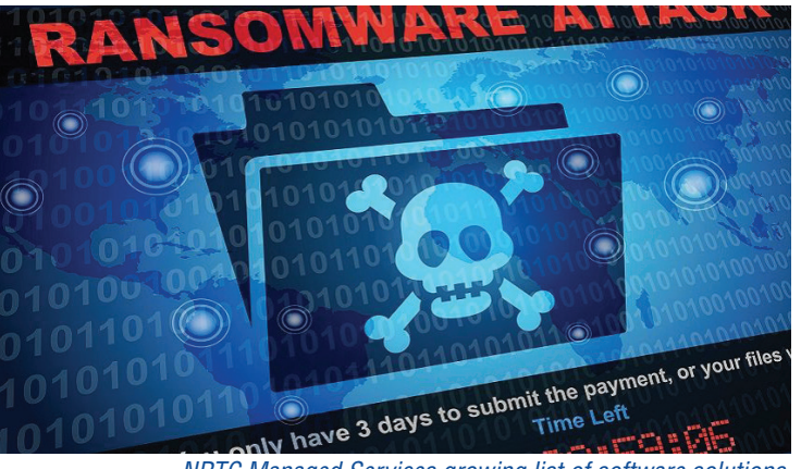
NRTC Managed Services growing list of software solutions and training programs help members protect themselves from ransomware, phishing and other serious cyberattacks.

The past two years have been marked by major cyberattacks, menacing government agencies, large corporations and individual internet users. Perhaps the most noteworthy incident was the May ransomware attack on the Colonial Pipeline, which shut down pipeline operations for five days and created temporary gasoline shortages through much of the East Coast.